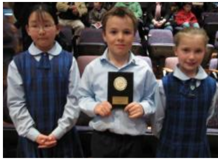
Training Band with their silver award