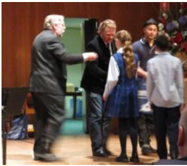
Concert Band 1 receiving their gold award