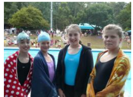
Senior Girls Relay Team