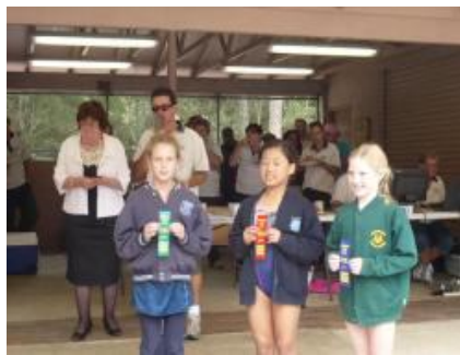
Charlotte wins the Green