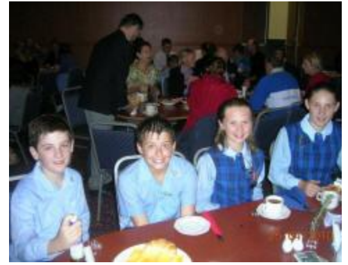
School Leaders at breakfast following the Anzac Day Dawn Service at Hornsby