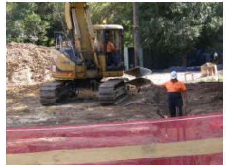
NEW BUILDING - JUNE 16