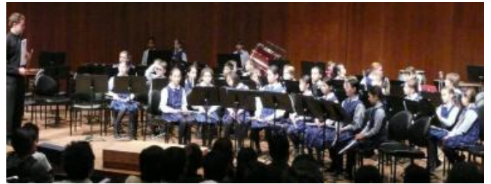
Concert Band 2