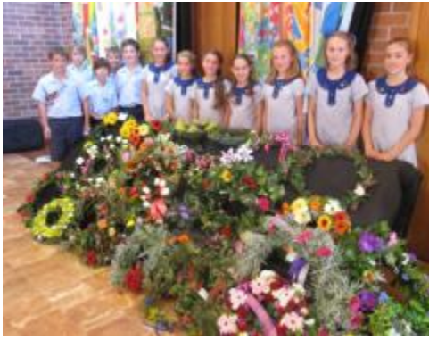
The School Leadership Team at the School Anzac Day Commemoration