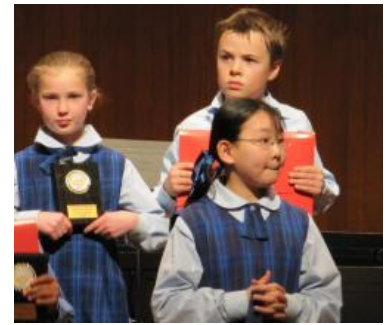
Concert Band 2 with their bronze award