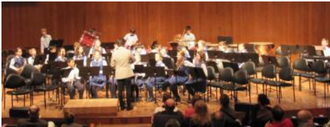
Concert Band 1